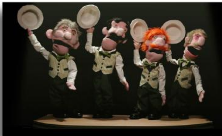
Production still from Shine 3D