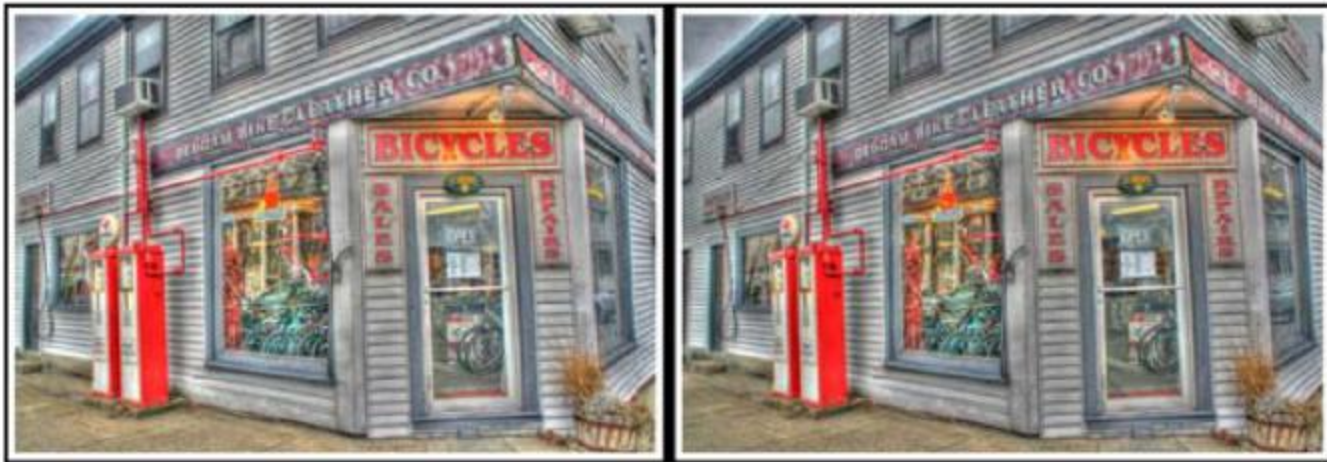
2nd Place: Dedham Bike & Leather by Jay McCreery - Stereo New England