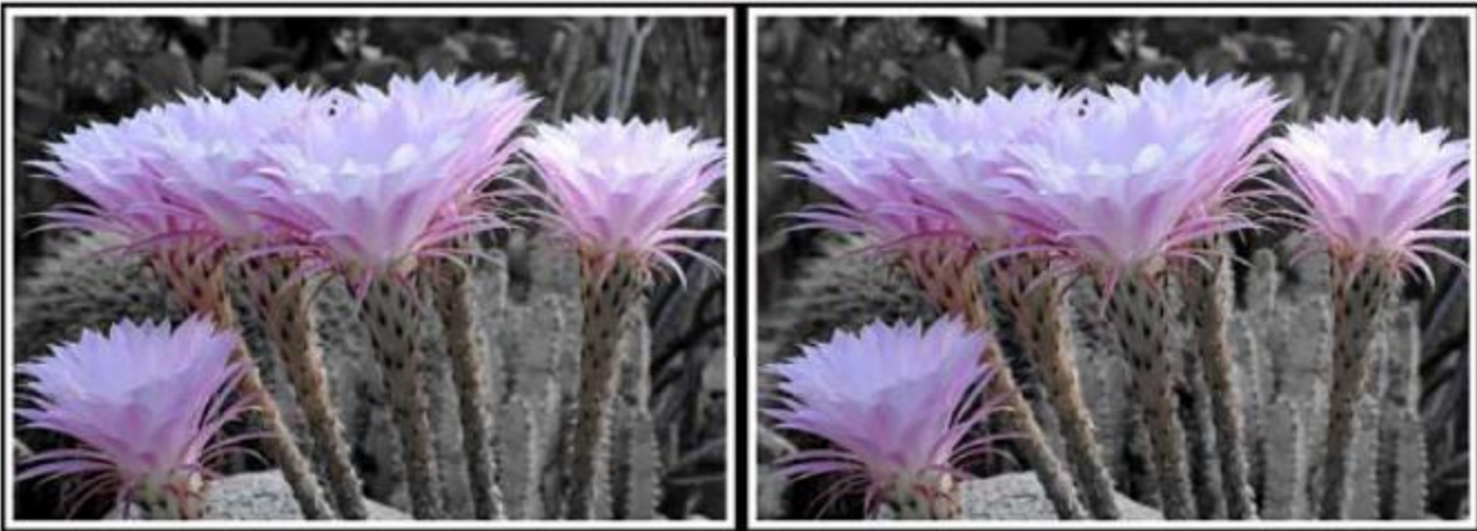
1st Place: Cactus Blooms by Jim Staub - LA3D Club

The May round will be judged by the Cascade Stereoscopic Club