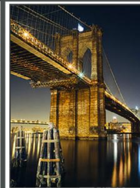
HAND OF MAN