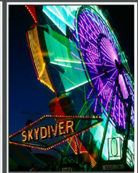
HAND OF CARNY