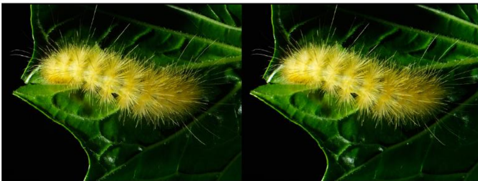
SECOND PLACE "Yellow Caterpillar" By Bob Venezia