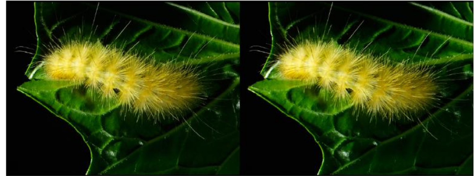
"Yellow Caterpillar" by Bob Venezia