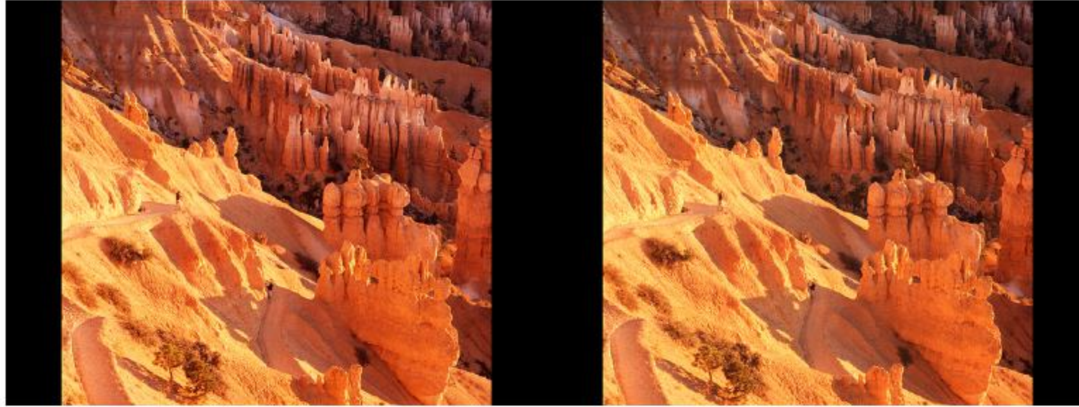
"Photographer's Playground" by Bob Venezia