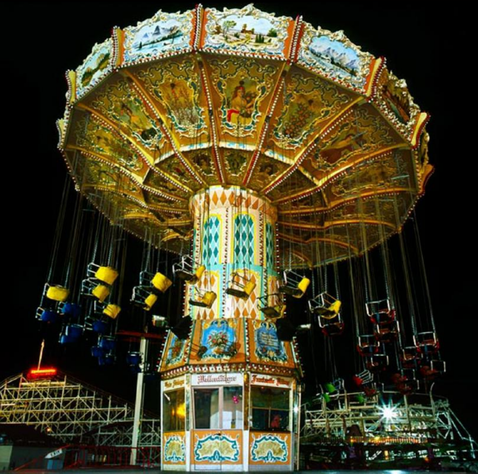
"Eye on Photography" Group show featuring works by Bob Venezia